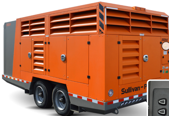
Sullivan-Palatek Electronic Controller (SPEC)